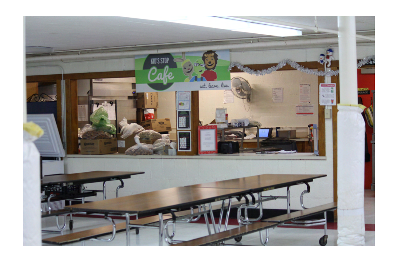
This is the cafeteria where you will eat with your class.